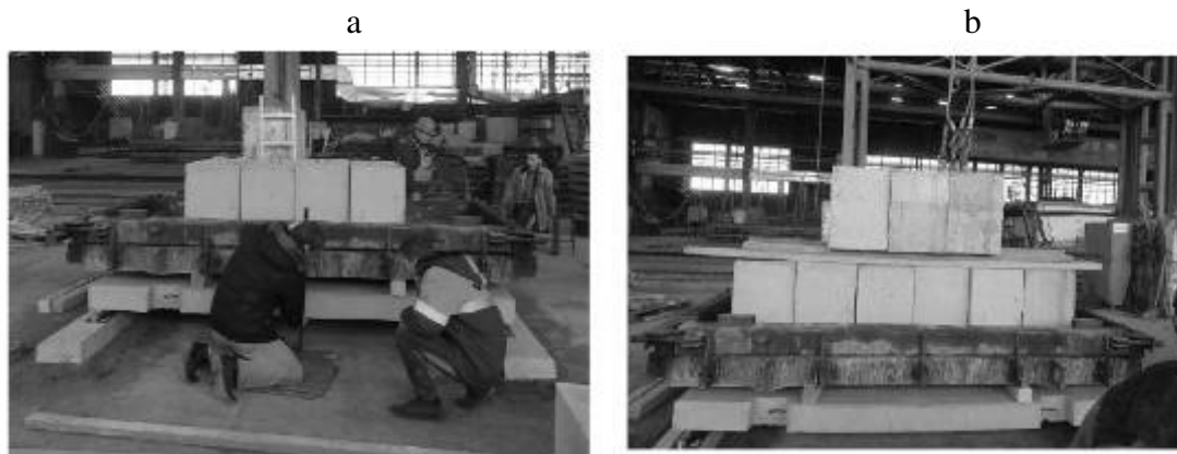
Figure 3 – Test plates 2P30.18-30