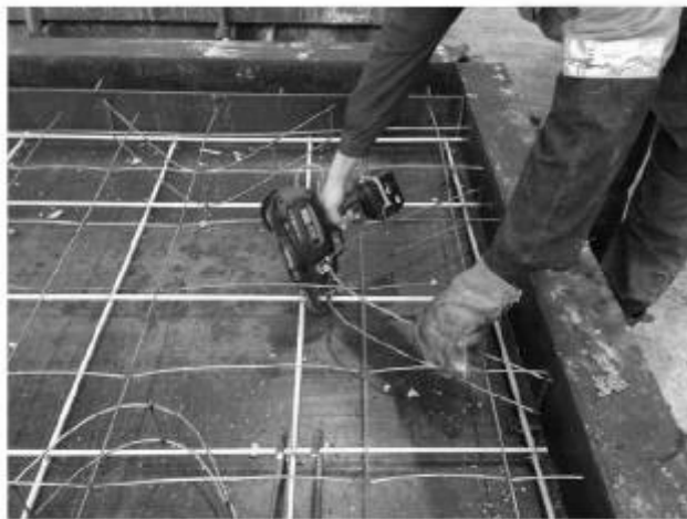
Figure 2 – Reinforcing plate

Given the great corrosion resistance of composite reinforcement, protective layer top and bottom plate was taken 20 mm instead of 30 mm. The class is concrete and technology of concreting was performed by [13] without changes. On the basis of measurements at the load plate was built the schedule according to the «load-your backbends». Fixing strain was used to load 11 t., thus destroying the plates with a load of 14 t took place [10].