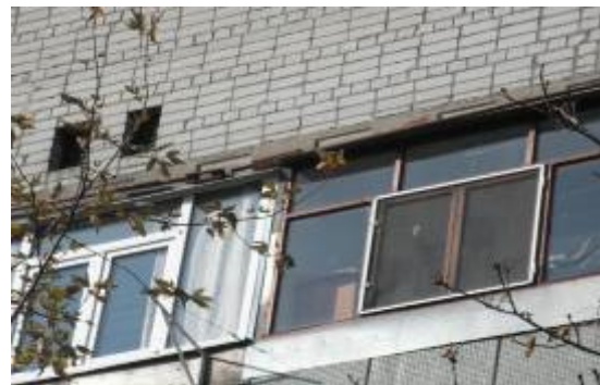
Figure 4 – Break of the upper tension bar along axis A at the level of the fifth floor overlap

Therefore, the technical condition of the outer and inner bearing walls is classified as unsatisfactory.