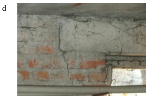
Figure 3 – Vertical cracks with opening width: a – 7 mm; b – 15 mm; c – 12 mm; d – 4 mm

Minor cracks in the walls and between the floor slabs occurred immediately after the house was occupied in 1977, but it suffered the greatest deformations in 1993 under the left block section I-II, in the axes 1 – 2 after the rupture of thermal pipeline in the spot of 90° turn. At the same time, to reduce deformations, the prestressed tension bars (Figs. 1, 2) of 36 mm diameter reinforcing bars were arranged with struts to create tension in it. Horizontal beams of the rectangular cross-section of two welded channels No. 24 are installed along the end walls, and the attachment of the weights to the beams is through an equal angle 140x10, which is installed in the corners of the building. Given the fact, that the free length between the points of attachment should not exceed 15 – 20 m (in our case it was 67.2 m), the cracks were opened in the future, since at considerable length the elastic absolute deformations in the steel of tension bars are very large. At the level of overlapping of the third and fifth floors, there was a break in the metal tension bar (Fig. 4), indicating a poor design of the reinforcement. Gypsum tell-tales were placed on the inner load-bearing wall, starting from the third floor, in the area of the stairwell. Cracks in it indicate the further development of deformations (Fig. 5). On the end wall of the left block section cracks are missing.