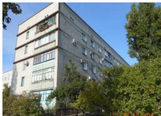
Figure 2 – View of the left side block section in the axes A-B and on the axis A