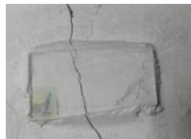
Figure 5 – Crack in the tell-tale (fifth floor)

Overlappings are the precast concrete void slabs 5.4 m long. There were cracks in the joints between the slabs in the basement and on the fifth floor, some joints unfilled with the mixture, which reduces the spatial rigidity of the building. The technical condition of the overlappings is classified as satisfactory.