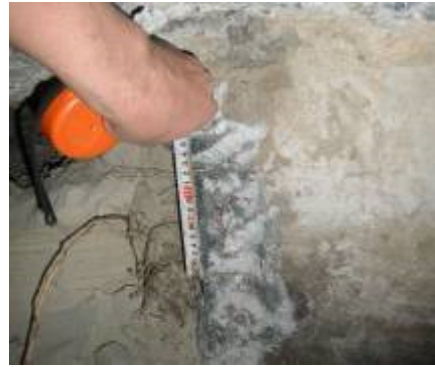
Figure 8 – The piles' view as grid component in pile reinforcement investigation: