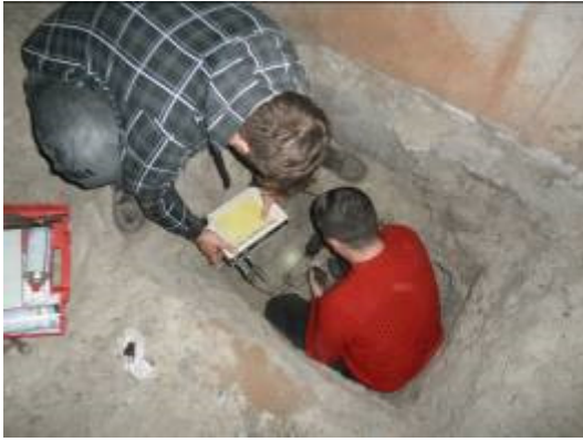
Figure 7 – Performing pile length control work

Compared to the nondestructive testing stage, during the investigation of the pile's reinforcement, the exploration shaft was deepened, revealing cracks in the pile body (Fig. 8). The pile was destroyed since the protective layer of concrete was split in a stretched zone. The concrete in the compressed area split and crumbled. The increment of the transverse reinforcement was 200 mm. It shows that the pile was not driven to the designed mark, it was “cut down”. The minimum length of the “cut” part was 600 mm. In this state, the pile does not withstand vertical compressive loads. The results of the instrumental control analysis of the pile's length and visual assessment of their integrity are summarized in Table 1.