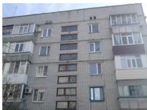
Figure 1 – Fragment of the left block section on the axis B

Cracks are typical for buildings with reinforced concrete spandrel beams that cause deformation of the window unit by turning it as a single rigid element. Cracks indicate significant deformation of the foundations' base of the left end section in the direction of separation from the main part of the building. The cracks propagation significantly reduces the spatial rigidity of the section because, for separated parts of the outer and inner walls, the spatial rigidity is no longer provided by the transverse walls of the stairwell. There are no cracks on the outer and inner walls of the staircase, which confirms the previous statements.